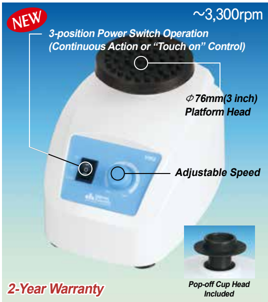
Multifunction Vortex Mixer Set “MaXshake VM30” with \phi 76mm(3”) Platform(PM110)

DAIHAN-brand® New-generation Multifunction Vortex Mixer-set, “MaXshake VM30”, 3,300rpm, with Certi. & Traceability with \phi 76mm(3 inch) Platform Head & Pop-off Cup Head, Variable Speed Control, Continuous or Touch-on Mixing NEW 다용도 볼텍스 믹서, 다양한 속도 조절, 인체공학적 디자인 적용, 강력하고 안정된 동작과 저소음