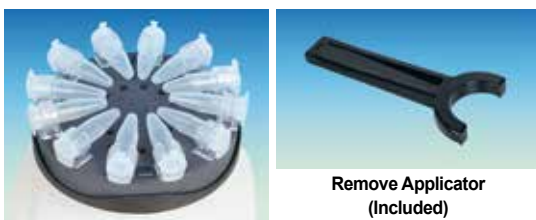
(3) Microtube Platform Head, 0.5~2.0ml Tube “PM310” (Optional)