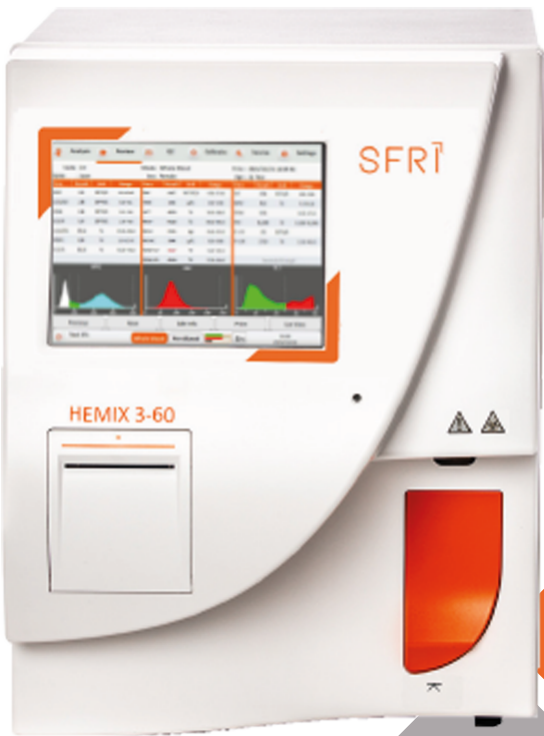
SFRI premium 3-part diff analyzer

Optimized for low platelet and high lymphocyte counts