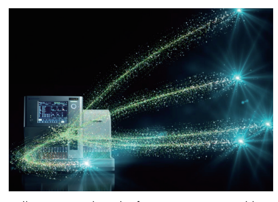
Celltac G's HL7 based information system enables seamless bi-directional information transfer to laboratory information systems.