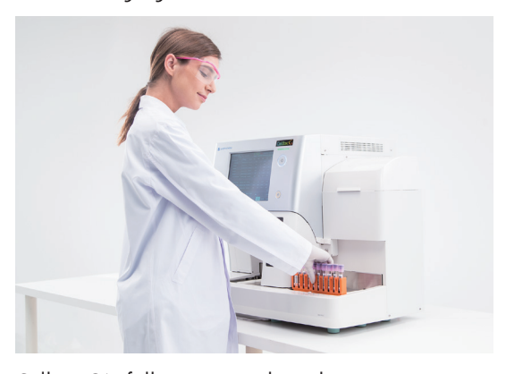
Celltac G's fully-automated random access walk away loading system enables up to 90 tests per hour by just continuously inserting the color-coded racks on the system.