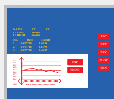
LJ/SD QC Chart